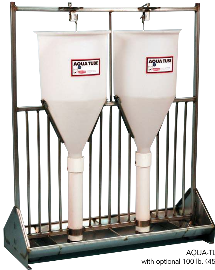
AQUA-TUBE® Feeder with optional 100 lb. (45 kg) hoppers