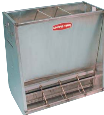
Nursery feeder with u-shaped bar guard divider.