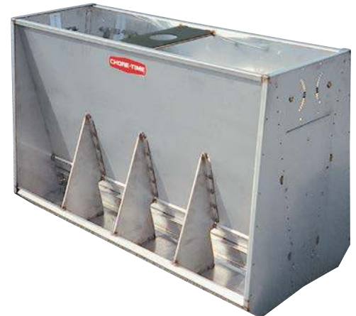
Wean-finish feeder with solid divider panels.