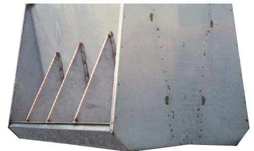
V-shaped bottom directs feed-clogging moisture away from the feed dispensing area.