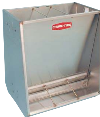
Finisher feeder with bar divider.