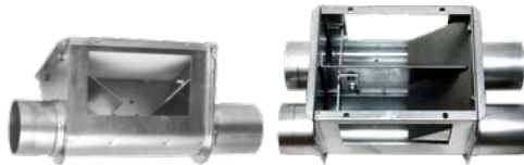
SINGLE AND TWIN METAL BOOTS

Chore-Time's twin-style (pant leg) transition features smooth, parabolic-curved sides formed with long-lasting polyethylene virgin materials and is opaque.