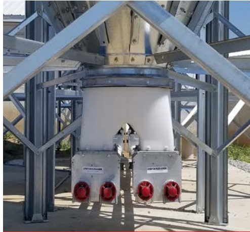
TWIN-STYLE (PANT LEG) TRANSITION

Chore-Time's single-style bin transitions are available in either translucent red or clear polycarbonate. Both help promote even feed flow and offer the ability to visually inspect the flow of feed to the auger system.