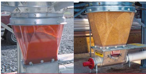
POLYCARBONATE UPPER BOOTS