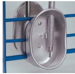
< Nursery Cup