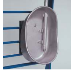
Universal Stainless > Steel Backing Plate used to mount cups