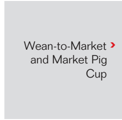
Wean-to-Market > and Market Pig Cup