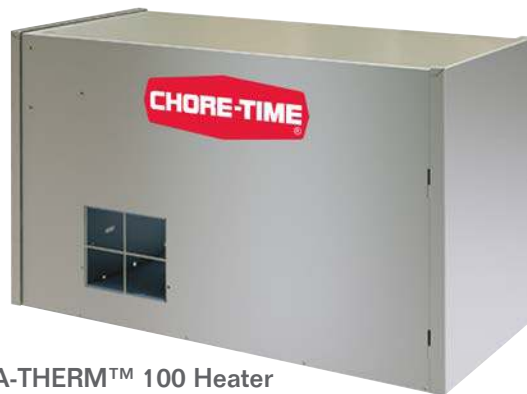
DURA-THERM™ 100 Heater