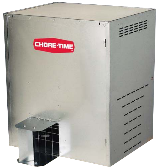
DURA-THERM™ 250 Heater

*Gas pipe layout assistance available to customers through authorized dealers.