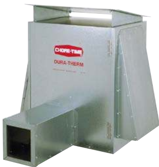
Outside Mounting Kit