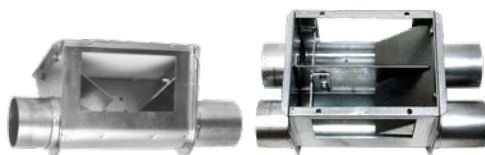
SINGLE AND TWIN METAL BOOTS

Chore-Time's twin-style (pant leg) transition features smooth, parabolic-curved sides formed with long-lasting polyethylene virgin materials and is opaque.